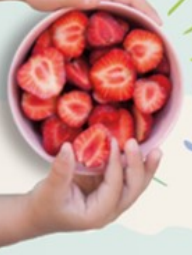
Fresh fruit and vegetables