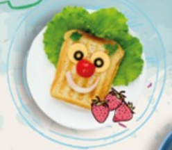
Bread, cereal or derivatives