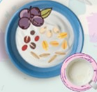
Milk or derivatives